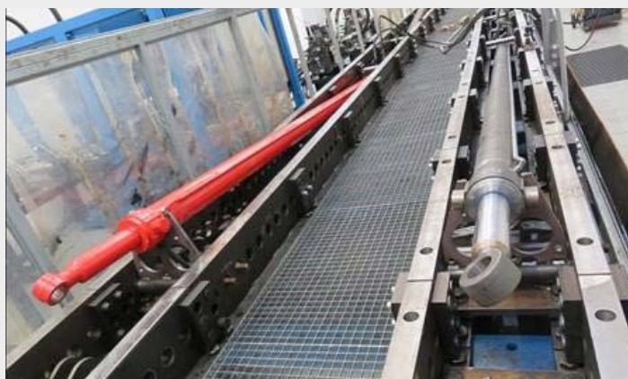
Comparative test between Genuine Parts and competitors