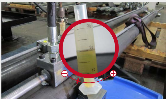
Internal and external leakage test

Each Genuine cylinder is designed to be perfectly suited to your machine.